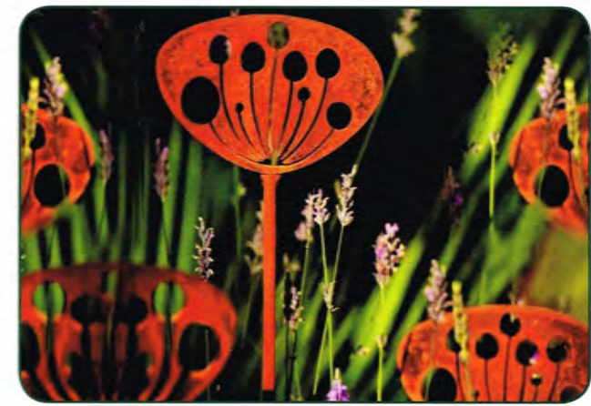
Above: Example garden art sculptures - incorporated in multiple positions within the development.

These are a major distinctive feature of our vision and include espaliered fruit trees, linear herb and vegetable gardens along paths, and other food growing areas. The whole community garden aspect of the project will have the capability to be managed by the smart infrastructure. The smart data collected by the community can be used by the residents to maximise water efficiency and plan planting. Other features of the smart village and infrastructure are documented on the Brookside website.