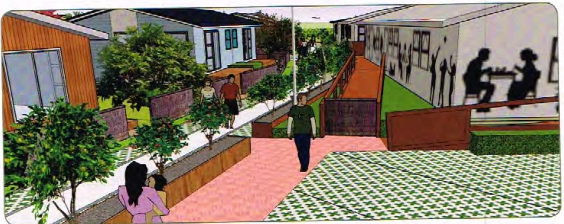
Above: Stage 1 community cafe and pathways with food trees.

The application has been received by council and the consent process is underway. There is still an opportunity for future residents to inspire and enhance the design potential and discuss features you would like to see incorporated into the project, including what smart features you would like in your own home.