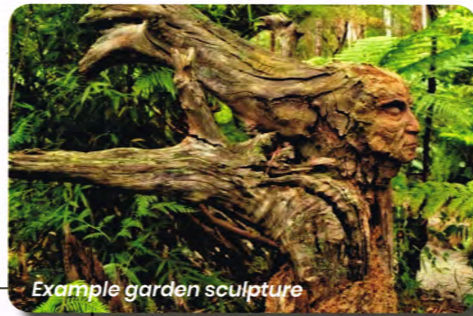
Example garden sculpture

The aim is to keep operational costs as low as possible with well insulated homes, efficient water and power appliances, food growing, shared tools, solar cells and collective purchasing of power, internet, water and insurance.