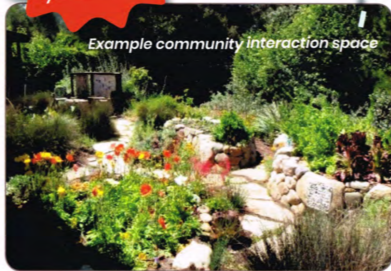
Example community interaction space

A range of house and land packages to suit your needs!