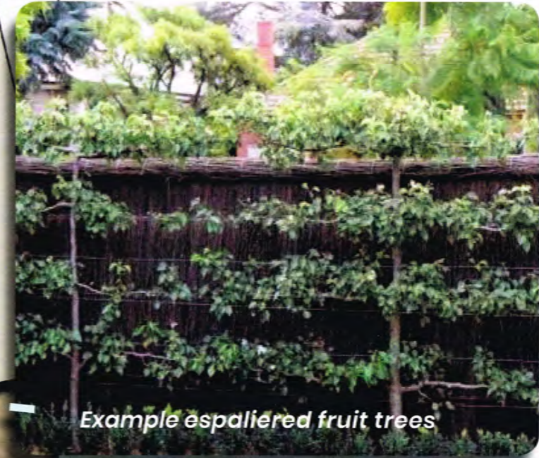
Example espaliered fruit trees

The Resource Consent is underway with council. Development will commence as soon as consent and sufficient sales have been achieved.