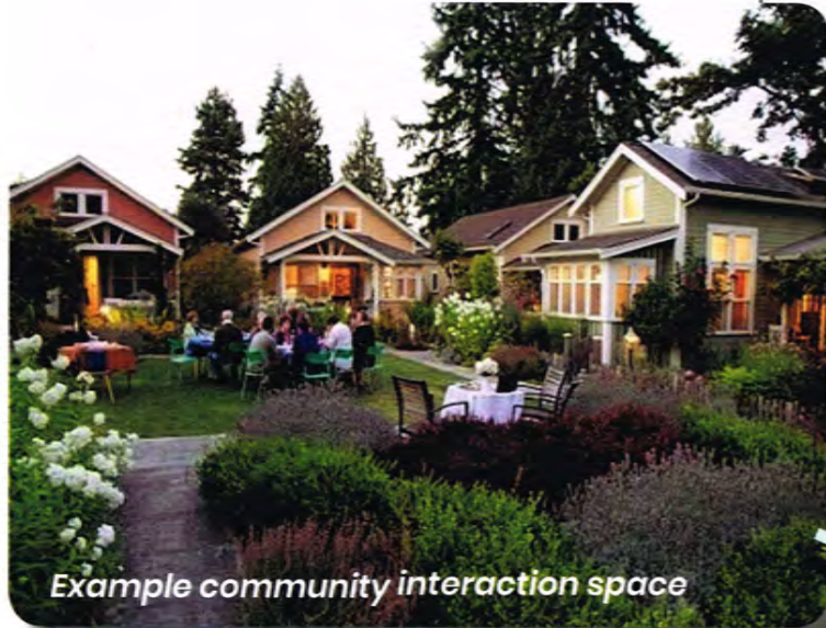
Example community interaction space

Other facilities: bookable visitor accommodation, shared workshop/art space, bookable meeting rooms and rentable storage units. These co-housing services are mainly designed to facilitate residents having smaller and more affordable private homes.