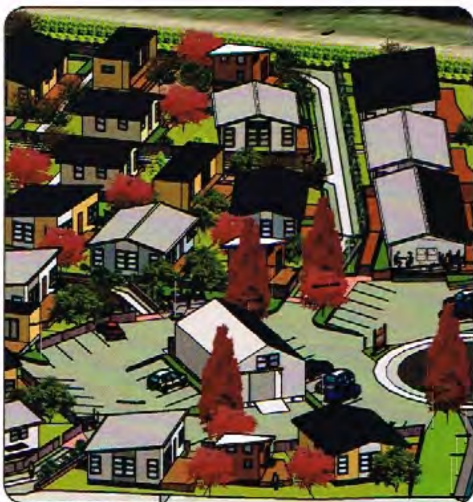
Right: residents shared space Above: foreground - community cafe & parking

We are currently looking at the range of $220,000 - $480,000 for 1, 2 and 3 bedroom dwellings. This will be confirmed when Resource Consent is issued. We are also investigating shared equity models to assist people into home ownership